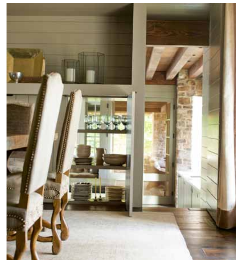
LEFT: A custom-made table abuts the kitchen island to create more prep space and encourage sit-down meals. Open shelving offers plenty of storage and is also accessible from the dining room's pass-through. Metal stools, R&Y Augousti. TOP: The dining room's French farm table is surrounded by Louis XIII-style chairs covered in Pindler & Pindler's Laredo faux suede. The landscape painting is by the wife's father, and the walls are painted Farrow & Ball's Hardwick White. ABOVE: A doorway in the dining room leads down to the kitchen.